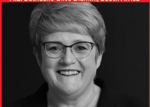
Ms. Trine Skei Grande, Norway