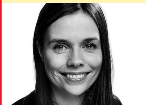
Ms. Katrín Jakobsdóttir, Iceland